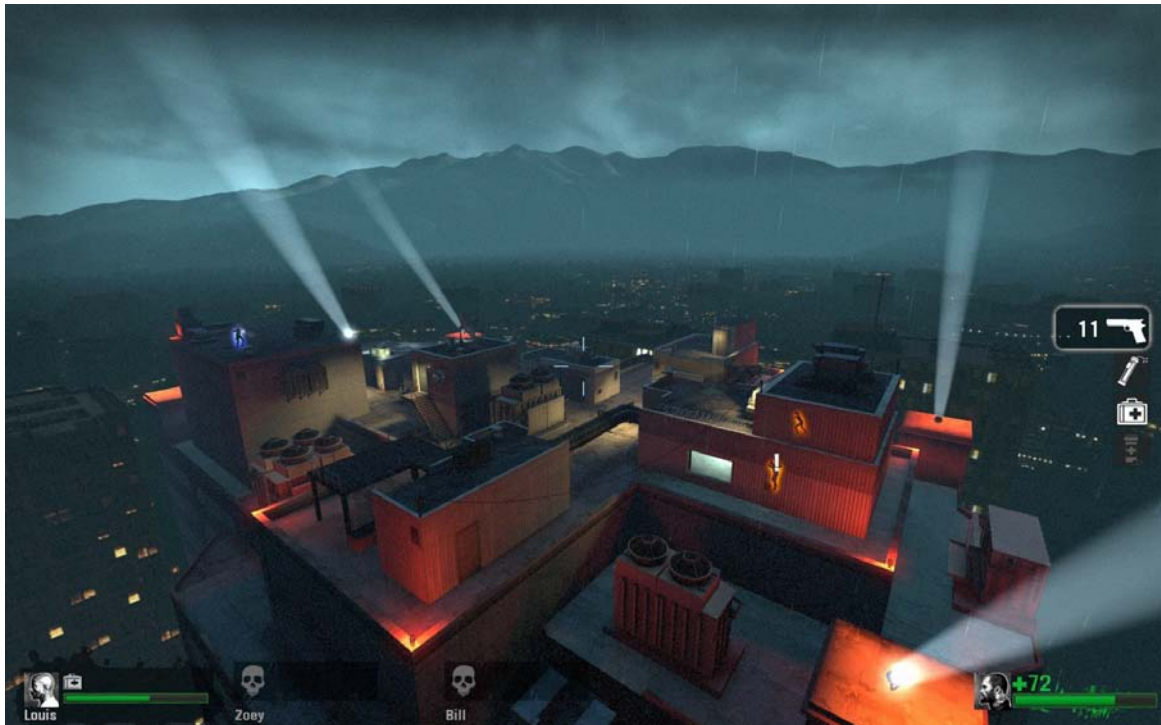
Figure 4. Urban night-time scene, showing dynamic health indicator bars ( Left4Dead ; courtesy of Valve Software)

(e.g. in Left4Dead , pipe bombs beep with increasing frequency as they near detonation, and the player's view becomes increasingly dark and blurred as their health runs out when they are in need of rescue by another player).