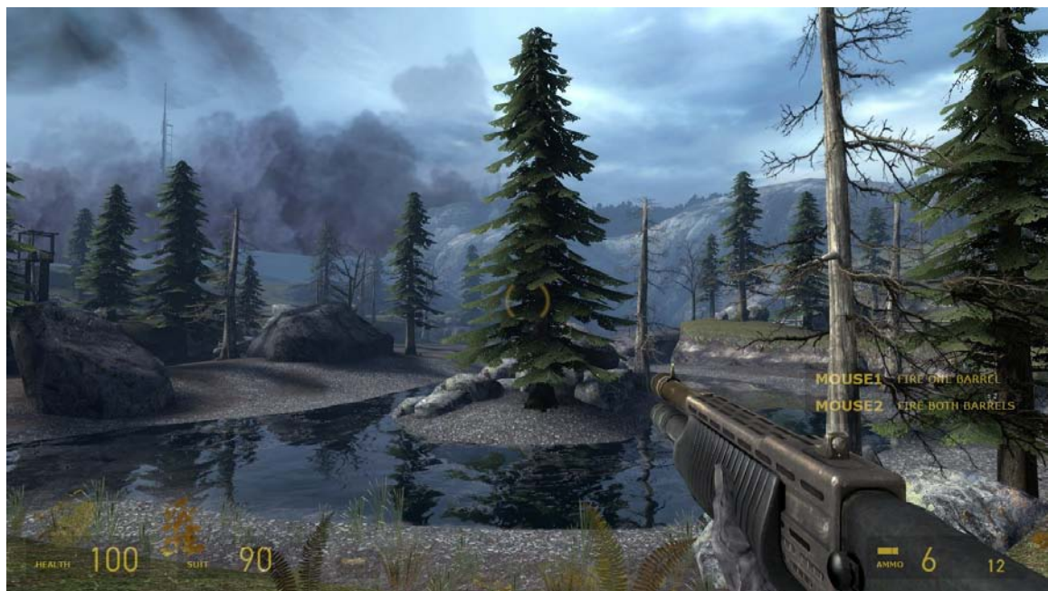
Figure 1. Realistically rendered fictional landscape of first-person shooter game ( Half-Life 2 ; courtesy of Valve Software).

playing and adventure games, several kinds of simulation game (including driving and racing games), and strategy games which involve the evolution of settlements, cities and civilisations. There are many videogames with a less recognisable geographical content, including: puzzle games (especially board games, quizzes and classic titles such as PacMan and Tetris ), music games (such as Guitar Hero and Jam Sessions ), and many children's games. Although a large number of sports games (e.g. tennis, soccer, snooker, American football, and Olympic events) have little intrinsic geographical content, others (such as golf and car racing games) are of considerable interest to GIS, because of their often fastidious and innovative approaches to micro-terrain modelling and townscape representation. These, and other less geographically relevant videogames, will be discussed where aspects of their design, role and usage are relevant in a GIS context.