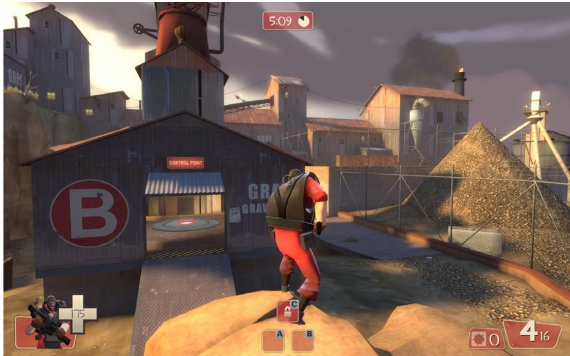
Figure 7. Highly stylised landscape of a first-person game with player's avatar temporarily on display (Team Fortress 2).

developing more effective methods for spatial exploration, search and interrogation [46; 47] In this section, a number of VG interface ideas will be described, and their GIS potential indicated. (See [48] for a fuller discussion.) The discussion will focus primarily on software rather than on game hardware devices.