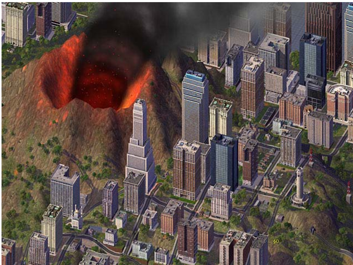
Figure 8. Urban infrastructure and irregular terrain as modelled in a grid-based strategy game ( Sim City IV ).

Most games adopt a single viewpoint throughout. However, in recent years, some popular games (e.g. Metroid ) have switched from one viewpoint to another in successive releases, and in other games, it is possible to switch between viewpoints during gameplay. In the first-person Brothers in Arms and Ghost Recon , the player can momentarily switch to a third-person camera to provide a tactical overview when the combatant has taken cover. The RPG game The Elder Scrolls III: Morrowind , for example, offers both first- and third-person viewpoints, with the latter being useful when the player's avatar wishes to display its winnings. In some games, the viewpoint is switched automatically, either to reveal important events (as in Civilization: Revolution ), to taunt opponents with amusing character animations or for replay purposes (as in Team Fortress 2 , Figure 8), or to reveal the player's avatar when it is injured (as in Left4Dead ). The temporary switch between viewpoints to make use of their particular advantages highlights the benefits of making both available in the same game.