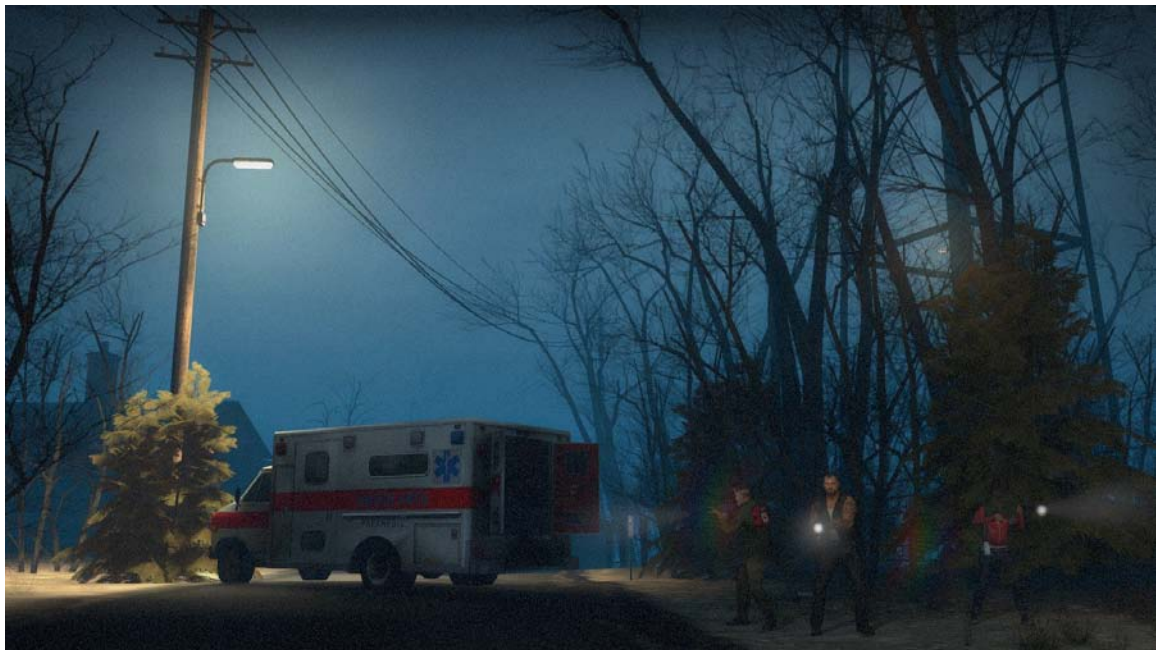
Figure 5. Atmospheric evening scene involving darkness and local lighting (Left4Dead).

A further lesson for spatial data visualization concerns how well 2D visual symbol coding translates to 3D. Although the approaches explored by Kraak [30; 31] do not appear to have been implemented in VGs, careful graphical design has established some working principles for effective 3D visualization. An example is found in the team-based, multi-player game Team Fortress 2 , where the player takes on one of 9 distinct roles. Because it is important to be able instantly to identify another player's team and role, the avatar for each role has a unique silhouette, easily distinguishable from all the others, which retains its distinctiveness when viewed from various directions and under varying lighting conditions. A related technique is used to show objects even when occluded, as in the 'shadow Mario' used in Mario Sunshine/Galaxy , whose silhouette at least is always visible, even when the character is occluded. In general, automatic cameras and environmental design are concerned with mapping 3D worlds to effective 2D views at any given moment.