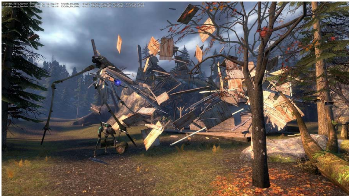
Figure 6. Countryside scene showing farmhouse being torn apart by alien creature (Half-Life 2).