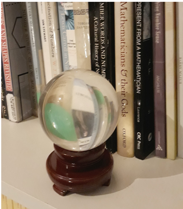
Figure 1. My crystal ball, now adorning my bookshelf.