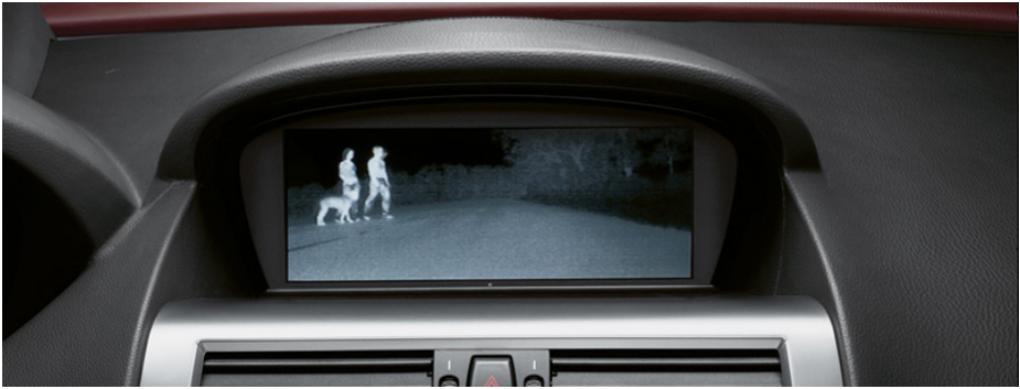
Fig. 1. BMW iDrive's night vision (BMW, 2008)