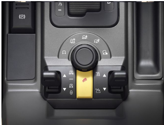
Fig. 2. Terrain Response available on the Land Rover Discovery 3 (Land Rover, 2006)

Since its release in 2006, The Land Rover Discovery 3 comes complete with an assistive system known as Terrain Response, which allows the driver to select the type of configuration, via an in car dial (Figure 2), in reference to the terrain type that they are about to travel over. The dial has five settings: a general mode, for everyday driving; grass, gravel and snow driving; one for travelling through mud and ruts; sand; and finally a rock crawling mode. For each setting the system will adjust the vehicles characteristics to best suit the terrain type. ABS, traction control, stability control, suspension, the shift schedule of the transmission, the 4WD differentials and even the engines throttle response are all but some of the settings adjusted by the system [2].