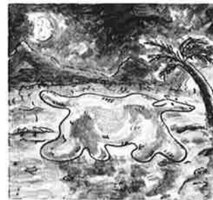
Mikel Horl Slowbody , 1995 Etching and monoprint.