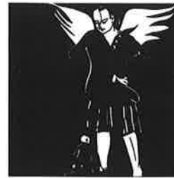
Andrzej Klimowski Big Angel, Little Man , 1994 Linocut.