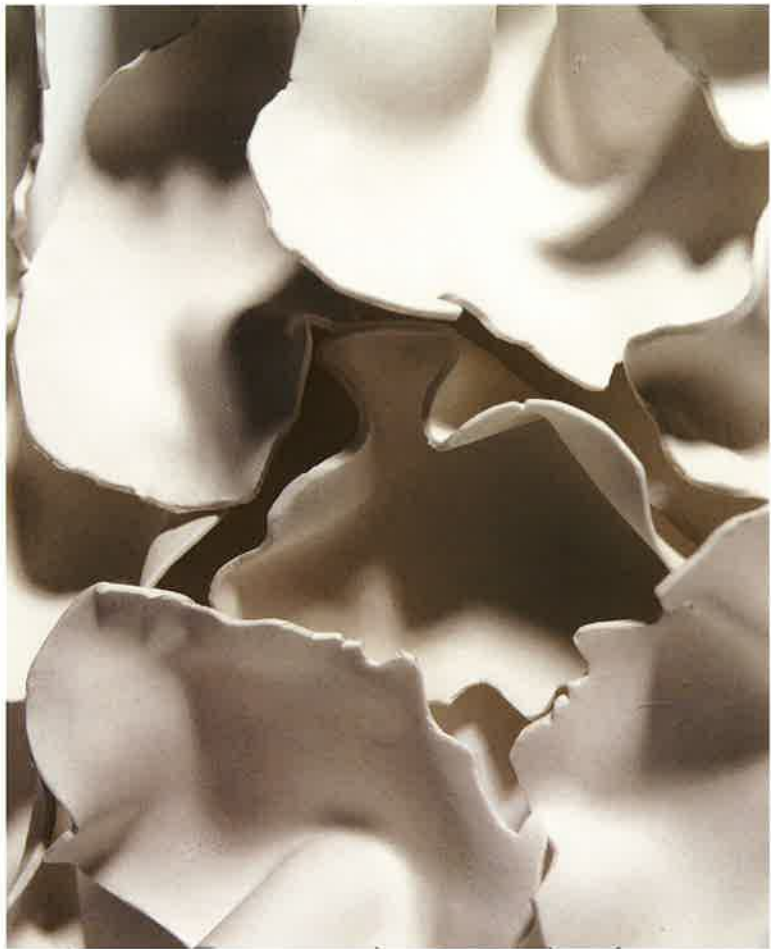
Ann Hullah. Detail from Value . 2001. Porcelain.