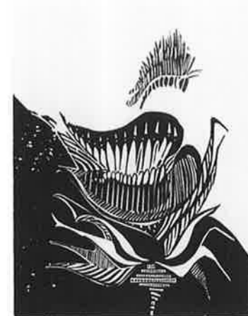
ARIA COMIANOU (ギリシャ) 145 COMPOSITION No.346 24 × 30 木版