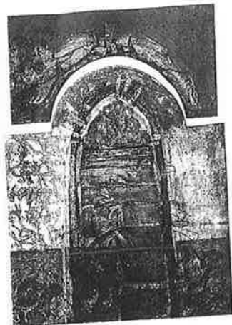
DOINA MISIAN (ルーマニア) 125 TRECEREA II... 47.5 × 68 コログラフ