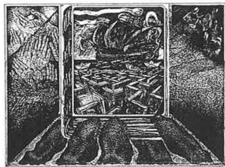
ADRIAN SELEGEAN (ルーマニア) 144 HOPE 18 × 24.5 銅版