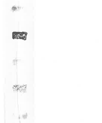
TIMAR ADRIAN (ルーマニア) 141 I LITO TO RED LINE 100 × 23 石版