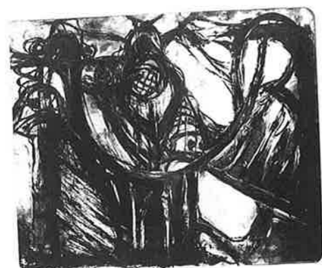
MIHAIL VOICU (ルーマニア) 129 Nucleus 28.5 × 23.5 石版