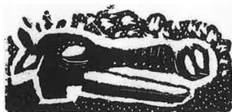
STEPHEN MUMBERSON (イギリス) 139 Mask 3 × 6 木版