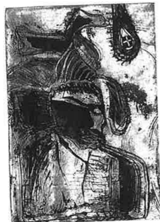
DAN ZBARCEA (ルーマニア) 126 SOLITUDE 37 × 25 銅版