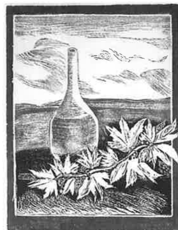
JENNY MARKAKI (ギリシャ) 147 Still life in landscape 64.5 × 50 木版