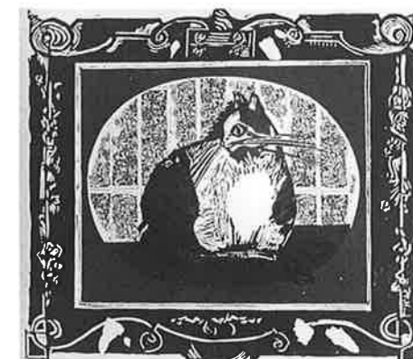
LUCIAN DOREL NAN (ルーマニア) 152 Pisica (Cat) 63 × 56 リノカット