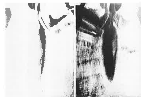
WENDY SIMON (カナダ) 149 STONE INSECT 51 × 70 銅版