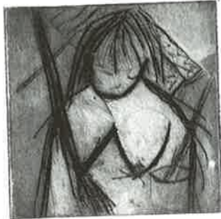
9070. ESPANYA PUETTER, EMILY EL ENIGMA COTIDIANO AIGUATINTA / PUNTA SECA