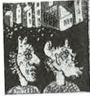
9069. ANGLATERRA MUMBERSON, STEPHAN TOURIST AIGUAFORT