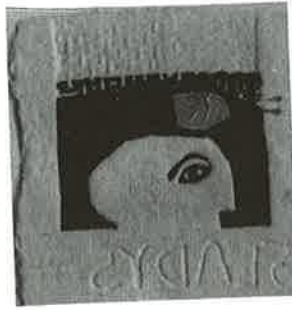
9073. URUGUAI AFAMADO, GLADYS EL PAJARO AZUL LINO / GOFRAT