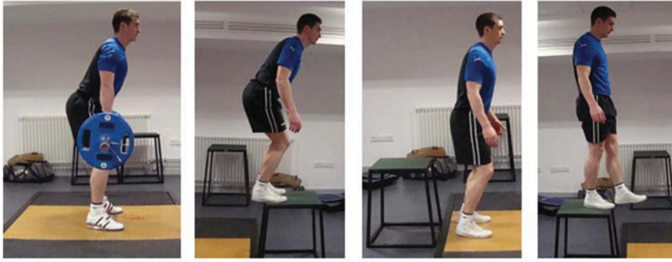
Figure 9-12 and caption 1 (from left to right): 2nd pull position; Jump up to box; drop land; step from box (prior to drop land or drop jump) and anklng (caption 1).

Caption 1: Anklng. The knees should remain straight as the athlete hops from one foot to the other. Throughout the swing phase, the foot should be dorsiflexed. At ground contact and the instant before, the plantarflexor muscles should forcefully contract. Only the ball of the foot should make contact.