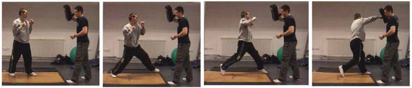
Figure 1 – 4. A Taekwondo athlete executing a punching technique, which enables him to strike from distance. The athletes must drive (through triple extension) from the back leg.

Despite the apparent need for athletes to place emphasis on the development of kicking techniques and despite the lack of scientific research, fist striking is still an important technique and will therefore be discussed. However, due to a lack of research into Taekwondo punches, empirically similar sports must also be considered. The need to address and develop the punch may be exemplified by Pieter and Pieter 98 who found that while the reverse punch was slower than the round house kick ( 11.38 \pm 3.68\text{m/s} vs. 15.51 \pm 2.27\text{m/s} ), it was faster than both the side ( 6.87 \pm 0.43\text{m/s} ) and spinning back kick ( 9.14 \pm 1.49\text{m/s} ). Similarly, while the greatest impact force was found for the spinning back kick ( 606.9 \pm 94.6\text{N} ), this was followed by the reverse punch ( 560.5 \pm 139.2\text{N} ) and then the round house kick ( 518.7 \pm 96.3\text{N} ) and side kick ( 461.8 \pm 100.7\text{N} ). 98 Moreover, Kazemi et al. , 73 suggests that punching skills should be trained since most athletes may not be trained sufficiently and may not have proper defensive techniques to counter.